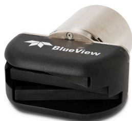
BlueView M450 D6-Mk2

**** All frequencies and beam widths are nominal values