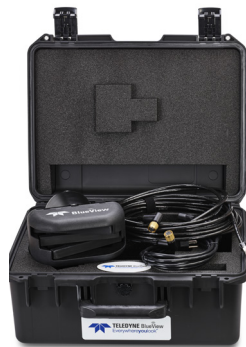
BlueView M-Series Accessory Kit (example)